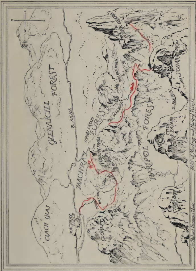
MAP of Macrory and Harpöl Forests to illustrate the concluding chapter.